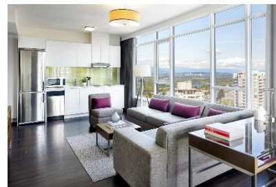
Element Vancouver Metrotown